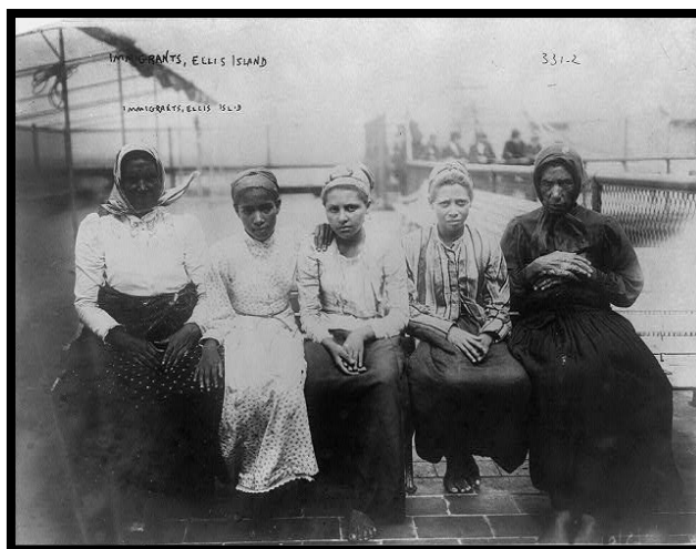
Immigrants, Ellis Island

Our second speaker will be a representative from the US Border Patrol, Spokane Sector giving us an overview of their mandate (what that office is supposed to do and what it's prohibited from doing); how their job has changed in the last few years; and how they decide where to deploy their resources.